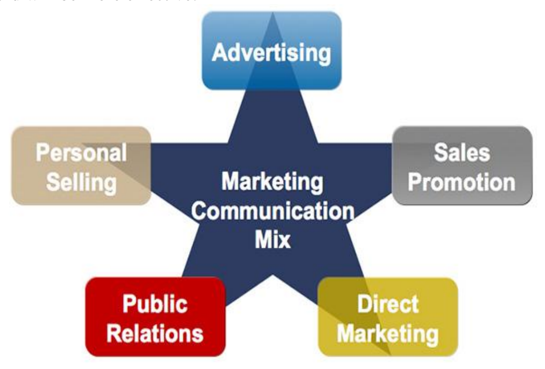
Fig. 2. Marketing communication mix

Given the messages that the company receives through feedback from customers on various aspects of sales, you can correctly transform them to ensure that these messages are well received and ultimately trustworthy in the eyes of people. In addition, since it is pragmatic, people will not be bored, and the recall of the brand will be more effective.